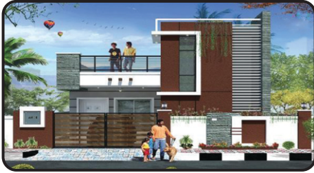
WEST FACING Independent House