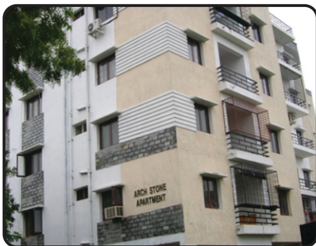
Arch Stone Apartments at Bandalaguda