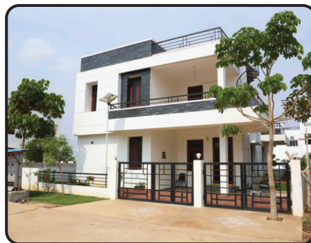
MSR Rish Valley – Villas