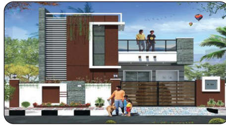
EAST FACING Independent House

Independent House Plot Size - 200sq. yds. 900 Sft (Rs. 27,00,000*) 1100 sft (Rs. 30,99,900*)