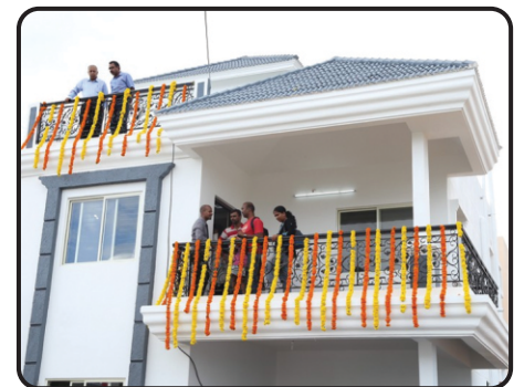
The Regent Villas at Bangalore

PROJECT BY Saheli Estates Constructive Ideas